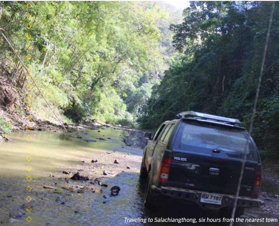
Traveling to Salachiangthong, six hours from the nearest town

"To reach some destinations, the vehicles had to travel for four to five hours via streambeds, but during each mission the volunteers treated the entire student body, from first-graders to ninth-graders."