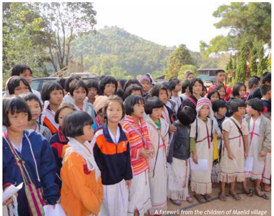
A farewell from the children of Maelid village