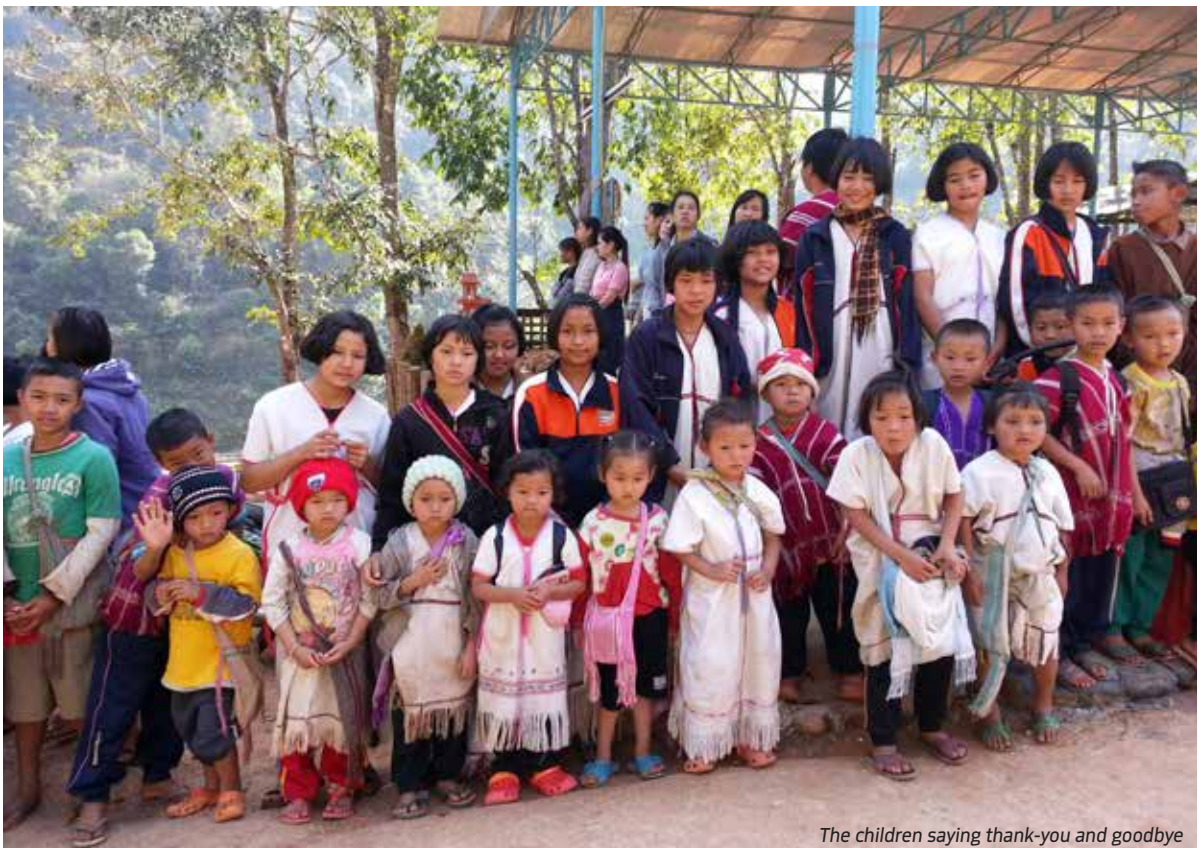
The children saying thank-you and goodbye