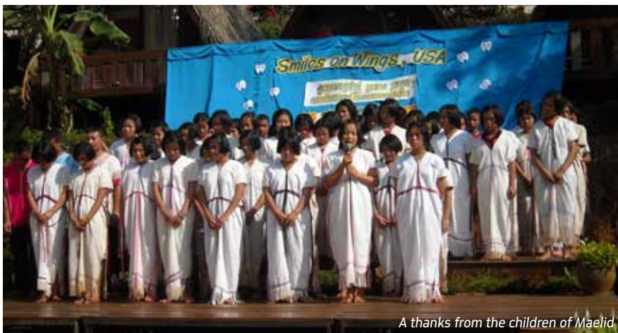
A thanks from the children of Maelid

As the motivational axiom says, you can be the change that you want to see in the world. Through Smiles on Wings, I can change the world—one girl, one village, one mission at a time. ■