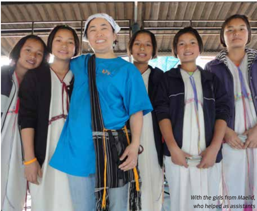
With the girls from Maelid, who helped as assistants

During the post-tsunami dental reconstruction project, hundreds of villagers received extensive dental care from a team of providers and assistants from all over the globe. After the project concluded in 2012, our team in the U.S. raised more funds to build a permanent clinic in the area, near a school that was once destroyed but now houses more than 800 orphans. The clinic was completed in 2014, and the Smiles on Wings team continues to visit to treat the