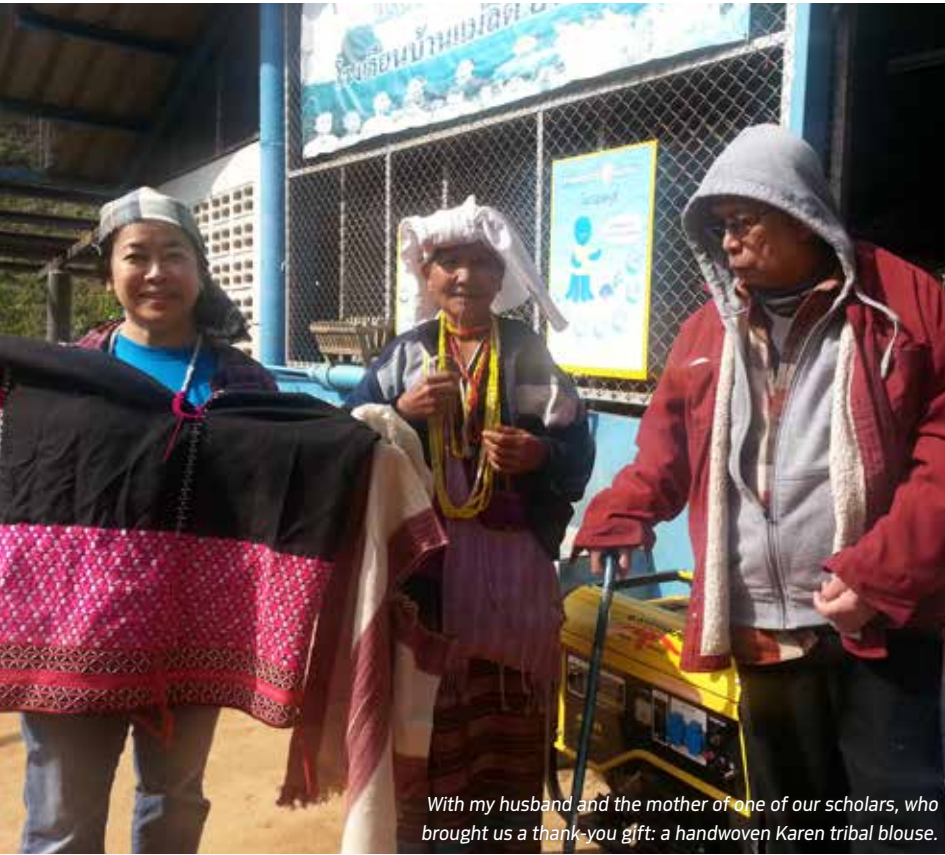
With my husband and the mother of one of our scholars, who brought us a thank-you gift: a handwoven Karen tribal blouse.

children, most recently in January 2016. Through additional grants from the After the Wave Foundation, the International College of Dentists, the USA Section Foundation and generous donors, the clinic will be fully furnished and serve area children for years to come.