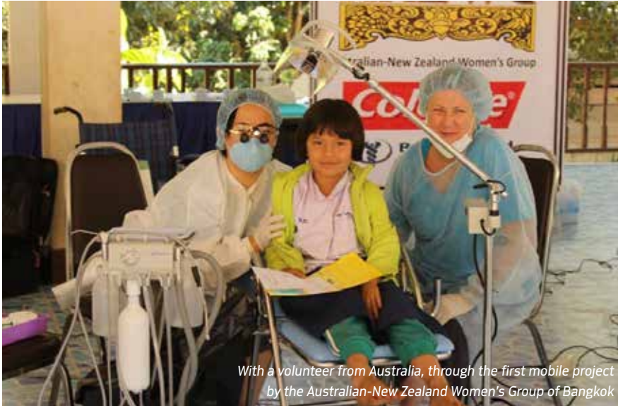
With a volunteer from Australia, through the first mobile project by the Australian-New Zealand Women's Group of Bangkok

to live again, keep my dental practice going, and simultaneously carry out the Smiles on Wings mission?